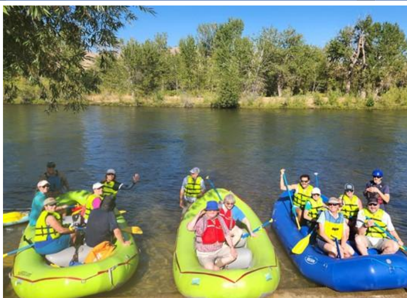
BREN Float Trip Idaho Environmental Forum, August 31st