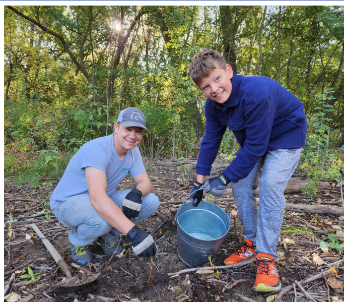
Xylem & BREN Volunteers plant willows at The Notch