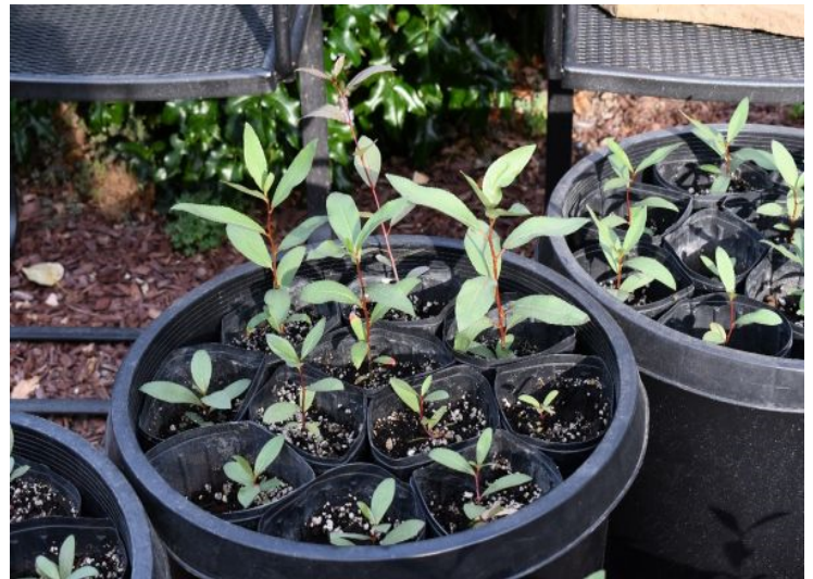
Native cottonwood seedlings grown by BREN volunteers

BREN continues to work with our public (City of Boise Parks and Recreation) and private partners (Edward's Nursery) to propagate from seed black cottonwood, a keystone species in the Boise River watershed that is at risk. BREN volunteers Kim Chmura, Jan Egge, and Rob Tiedemann recruited 34 volunteers to gather and perfect the cleaning of black cottonwood seed from trees growing along the Boise River, germinate seed in notable amounts, and grow seedlings to maturity. All will be strategically planted as young trees throughout the Boise River floodplain in 2022. Please click here to read our blog on this important project!