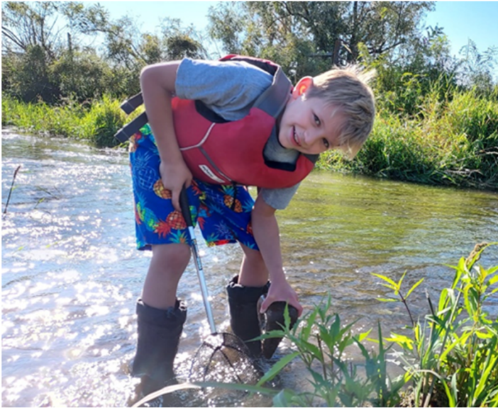
Crayfishing for water quality research, Aug 28 th