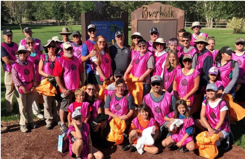
Boise River "Make it Pretty" Clean-up with Odell Brewing, Jun 26 th