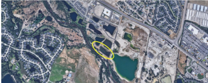
Map showing general location of Wood's Park