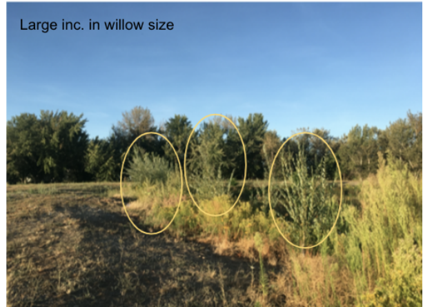
Large inc. in willow size