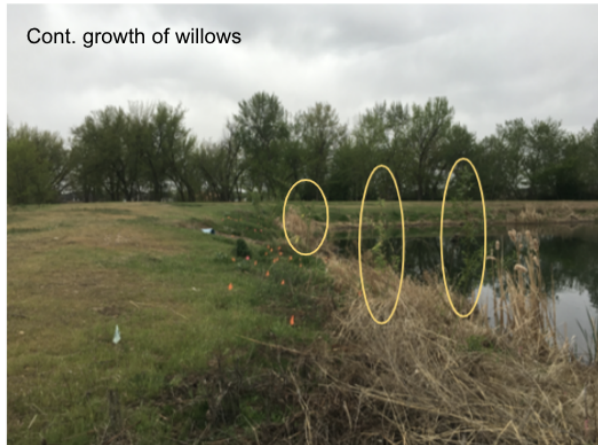
Cont. growth of willows